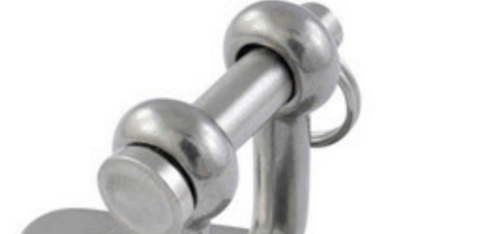
Groundplate D-shackle 815054408