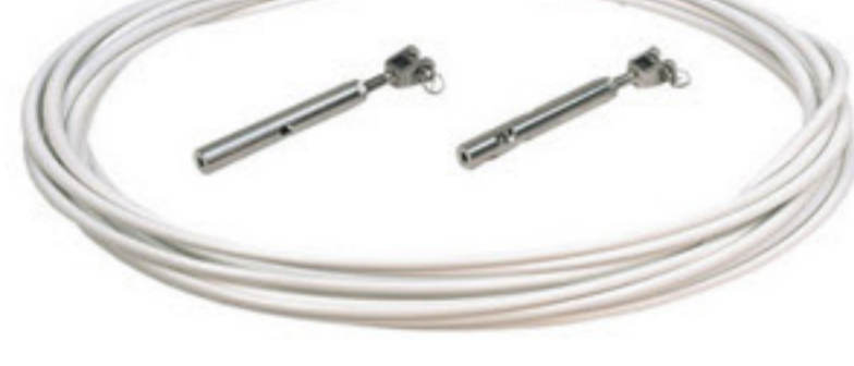
Guardrail set for self mounting 8475477

A4/ incl. mounting parts, wire rope coated (10 m)