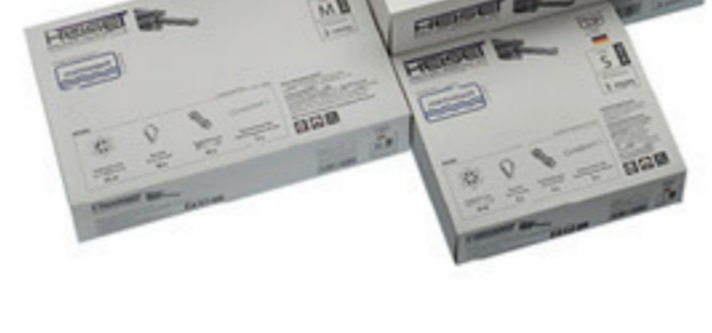
Wire rope set 81497943