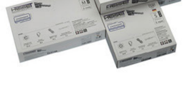
Wire rope set 81497942