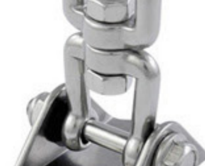
Groundplate with swivel shackle 815052408