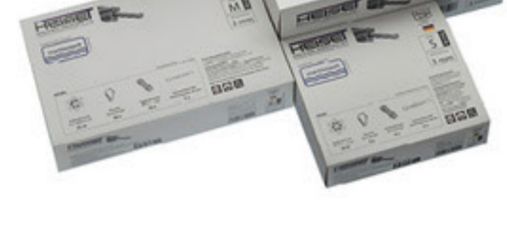
Wire rope set 81497944