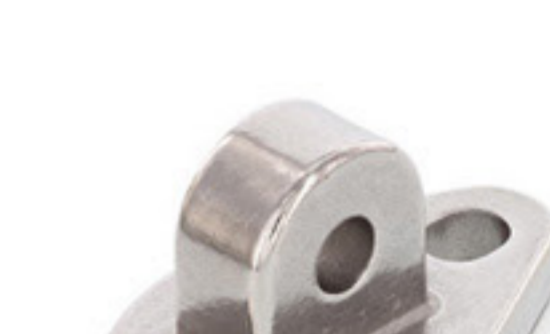
Groundplate with strap 815063