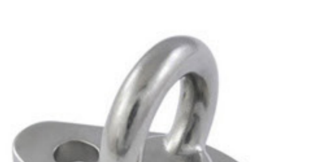
Groundplate with eye nut 815053408