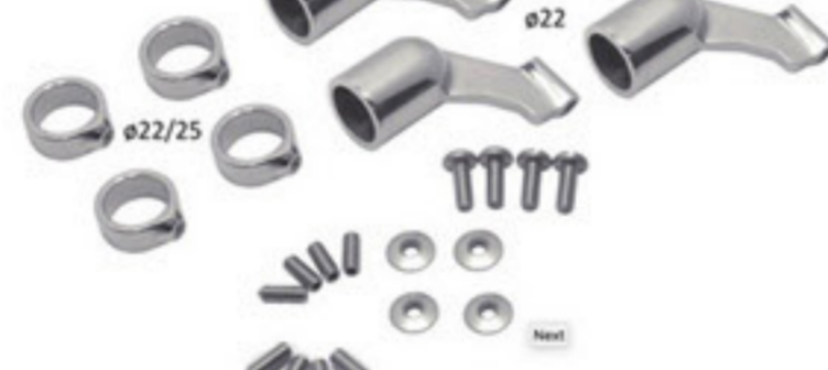
Sprayhood rail holder set 814589425