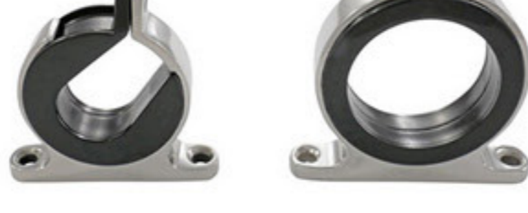
Fishing rod storage rack lockable 815062

A4/Plastic 2 parts, internal diameter 39mm