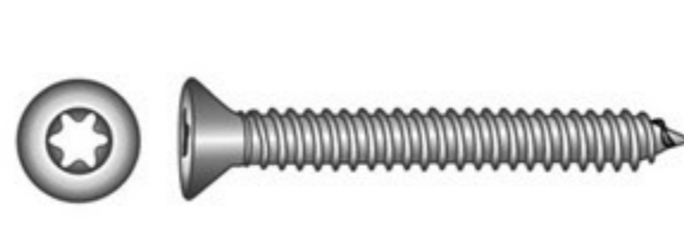
Countersunk head tapping screws, six lobe drive 14586446239

ISO 14586 1.4462 C 3.9X19 TX15 Duplex D6 - AISI 318LN In different sizes