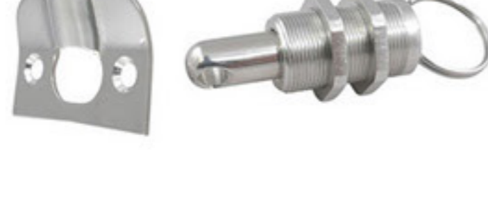
Lock cylinder with strike plate 815070456