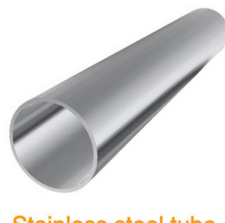
Stainless steel tube, welded, bendable 8292